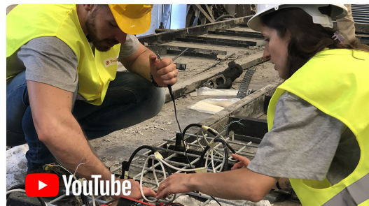
Concrete samples at NTS