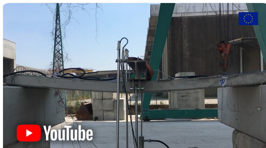
Testing the Endurcrete panels