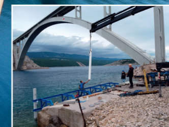
Installation of the EnDurCrete technologies at the Krk Bridge in Croatia.